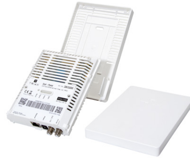
End-Point with WiFi and Ethernet over Coax, AC, Pro