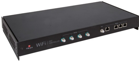
Controller for 32/64 Ethernet over Coax End-Points and WiFi, Pro